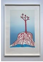
Louise Bourgeois The Ainu Tree (BOUR-9736) , 2000 six-color lithograph on paper 29 x 20 in. (73.7 x 50.8 cm) Edition of 100 BOU-0204