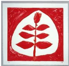
Louise Bourgeois Rose (BOUR-9335) , 2002 color lithograph on paper; initialed lower right, numbered lower left 14 x 14 7/8 in. (35.6 x 37.8 cm) Edition of 20 BOU-0276