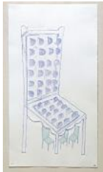
Louise Bourgeois Le Pere et les 3 Fils (BOUR-4127) , 1999 Lithograph with embossing and pastel on paper 24 x 13 in. (61 x 33 cm) Initialed lower right, numbered lower left Edition of 14 BOU-0273