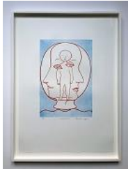
Louise Bourgeois Self Portrait (MOMA) , 1990-1994 Drypoint, etching, aquatint on paper, titled, signed, numbered in pencil 27 x 19 1/2 in. (68.6 x 49.5 cm) Edition of 60 BOU-0206