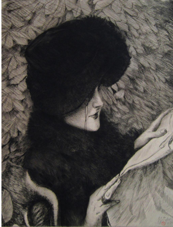
James Tissot (1836-1902). Le Journal (W. 73), 1883. Etching and drypoint. Edition about 100.