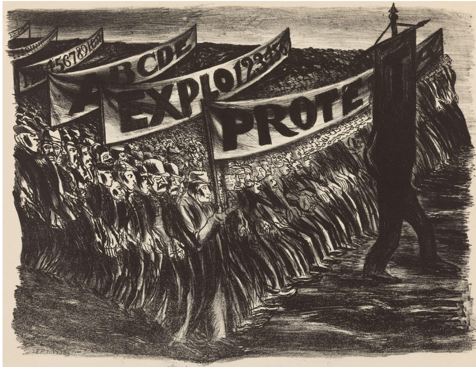
José Clemente Orozco.