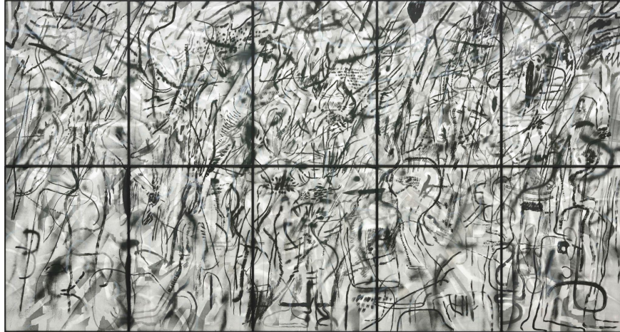
Julie Mehretu, Treatises on the Executed (from Robin's Intimacy) , 2022. 10-panel etching/aquatint from 50 plates 93 1/2 x 173 1/8" (237.5 x 439.7 cm). Edition of 22.