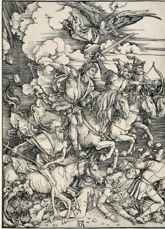
Albrecht Dürer, The Four Horsemen of the Apocalypse , 1498.