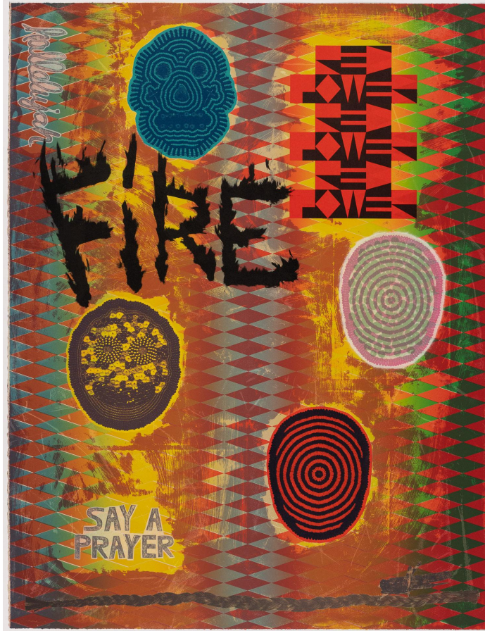
Jeffrey Gibson, SAY A PRAYER , 2021. Twenty-one color lithograph with chine collé elements. Paper Size: 39 x 30 1/4 inches. Collaborating Printer(s): Valpuri Remling and Lindsey Sigmon. Edition of 20.