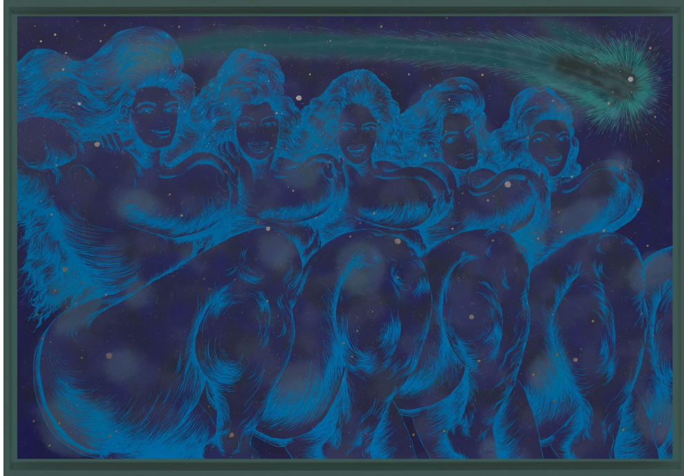
Ana Benaroya, The Swans , 2023. 19 color silk screen with gold and silver leaf, 48 x 71 inches. Edition of 15.