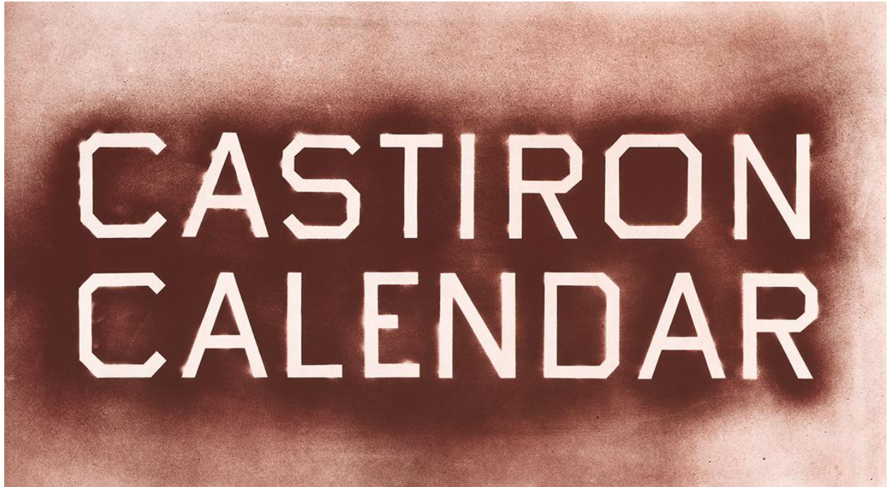
Ed Ruscha, Castiron Calendar , 2023. Color direct gravure. 26 1/4 × 42 in | 66.7 × 106.7 cm. Edition of 40.