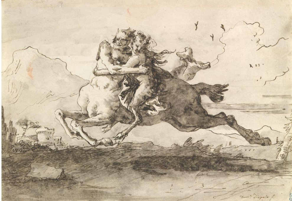
Giambattista Tiepolo (1696–1770). Centaur carrying off a female faun . Pen and brown ink and brown wash, over an underdrawing in black chalk.