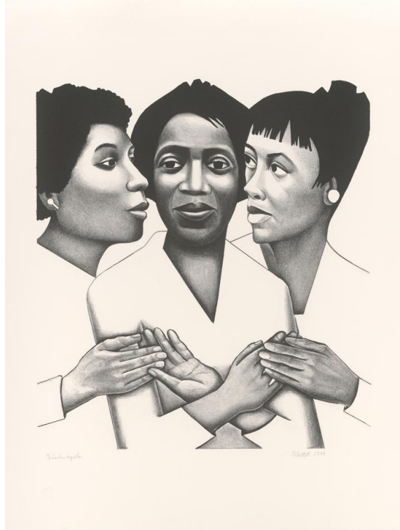
Elizabeth Catlett, Links Together, 1996. Lithograph, A/P.

Dolan:Maxwell offers an important lithograph by Elizabeth Catlett , Links Together , which depicts three Black women connected through hand holding. Catlett taught art at Dillard University in New Orleans—where she battled discrimination daily—and met her first husband, artist Charles White, while living in Chicago. She later studied lithography under Jacob Lawrence in New York City, and produced a number of works on paper that center mothers, daughters, and other images of dignified women. “The thing that I knew the most about was Black women, because I am one, and I lived with them all my life, so that’s what I started working with,” Catlett once said.