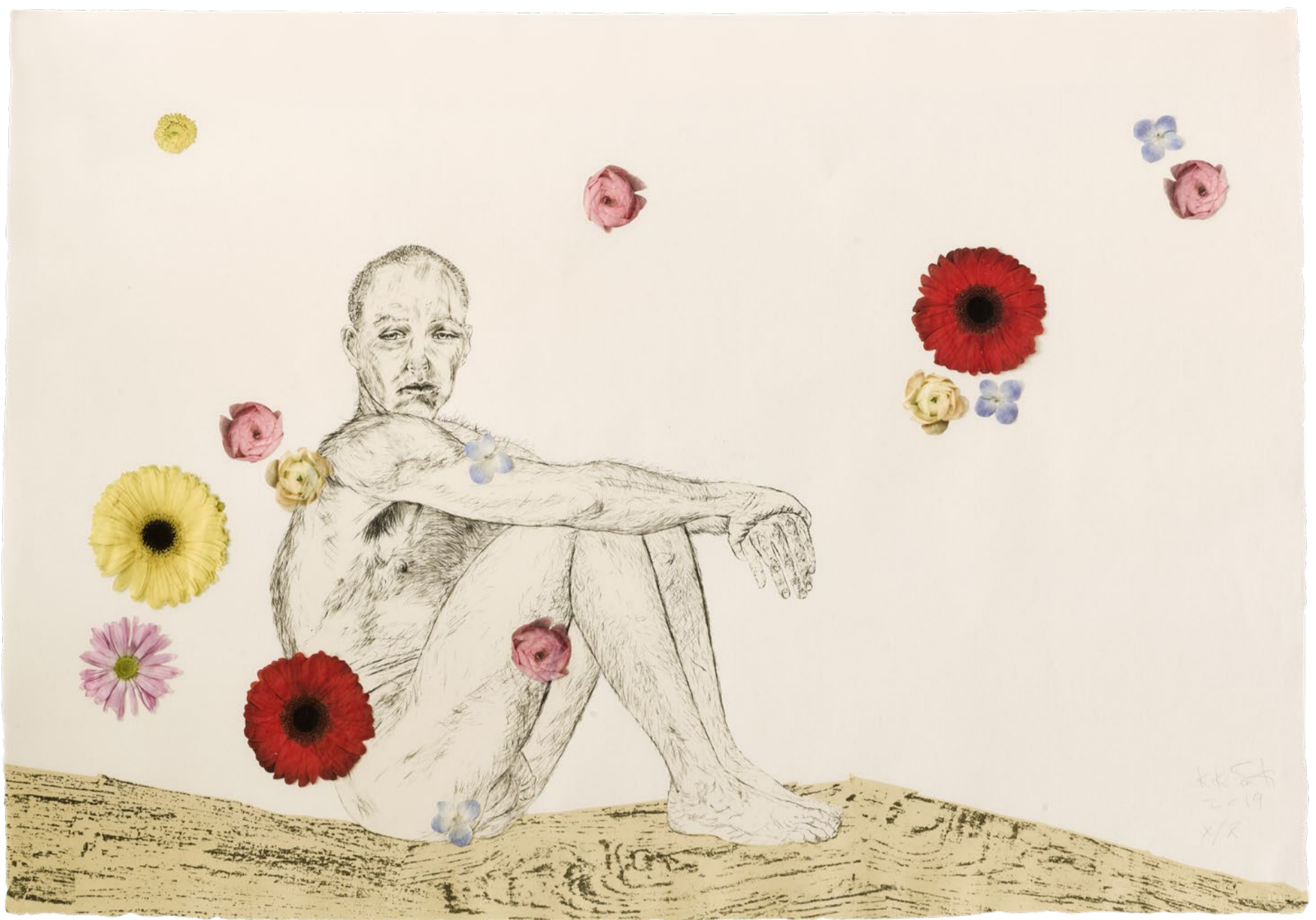
KIKI SMITH, Flowers in the Sky, 2019, Lithograph/Serigraph/Collage on indian handmade paper, 68 x 98 cm, Edition of 100, X / X, 20 AP

Dear friends of the gallery, dear friends of ART 19, dear friends of Amnesty International,