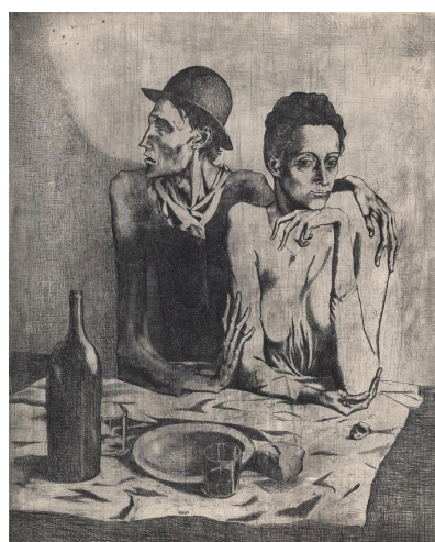
Pablo Picasso, Le Repas frugal, 1904. Etching, drypoint, and scraper. 18 1/4 x 14 3/4 inches.