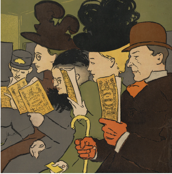
Edward Penfield (American, 1866–1925). Harper's: February, 1897 . Lithograph. 19 × 14 in. (48.3 × 35.5 cm). The Metropolitan Museum of Art, Leonard A. Lauder Collection of American Posters, Gift of Leonard A. Lauder, 1984 (1984.1202.96).