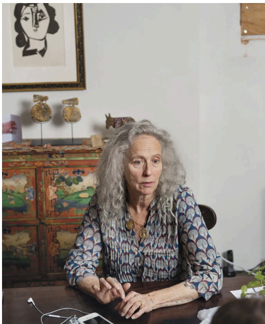
Kiki Smith, photographed in her New York City home and studio on Oct. 15, 2018.