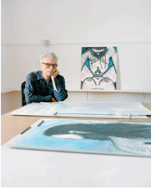
Portrait of Carroll Dunham.