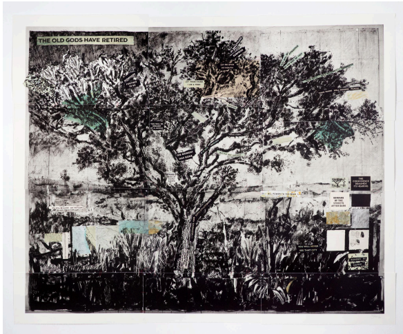
William Kentridge, 2022. The Old Gods Have Retired . Photogravure, sugarlift aquatint, direct gravure drypoint and chine with hand painting. Ed. of 20. 175 x 210cm.