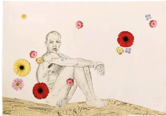
Kiki Smith, Flowers in the Sky, Lithograph / Serigraph / Collage on Japanese handmade paper, 68 x 98 cm, 2019.