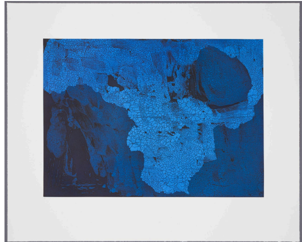
Leonardo Drew, American (b. 1961), CPP10, edition 9/15, 2015, color hardground etching with aquatint, 27 x 33 in., image: 18 x 25 inches; frame: 29 7/8 x 36 1/8 x 1 1/2 inches